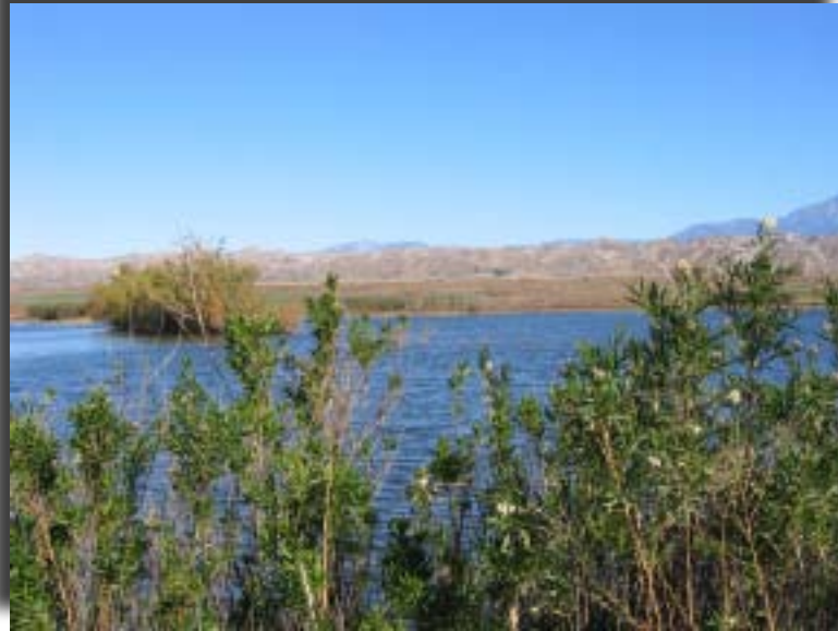
Winter view at San Jacinto Wildlife Area.

Please take time to make a donation to help us continue our efforts to challenge the latest version of the 11,350 unit Villages of Lakeview project on the southern border of the San Jacinto Wildlife Area and continue our World Logistics Center litigation. You can make checks out to the "Sierra Club" with the notation WLC/VOL and send your donations to: Sierra Club—Moreno Valley Group, P.O. Box 1325, Moreno Valley, CA 92556-1325. Thank you to all who have already donated.