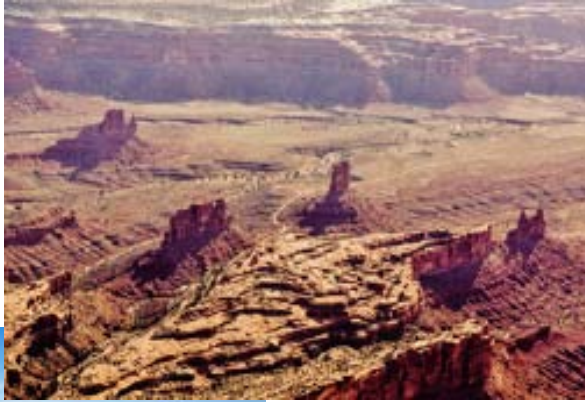
Bears' Ears photos.

The Sierra Club and many conservation organizations worked successfully for President Obama to protect 550 million acres in the West and the Pacific as new national monuments. Pictures