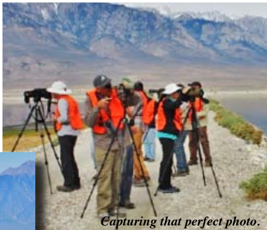
Capturing that perfect photo.

From the top of Mt. Whitney down to Death Valley, from Owens Lake to the Bodie Hills, and many places in between, Friends of the Inyo connects thousands of people to their public lands each year through hikes, tours, volunteer opportunities,